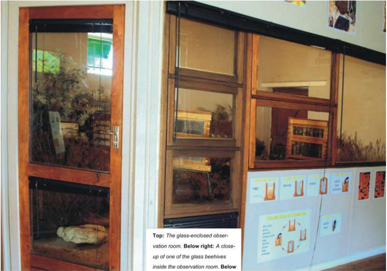
Top: The glass-enclosed observation room. Below right: A close-up of one of the glass beehives inside the observation room. Below left: The information display area. Opposite page: Part of the information area that is devoted to the honey badger.